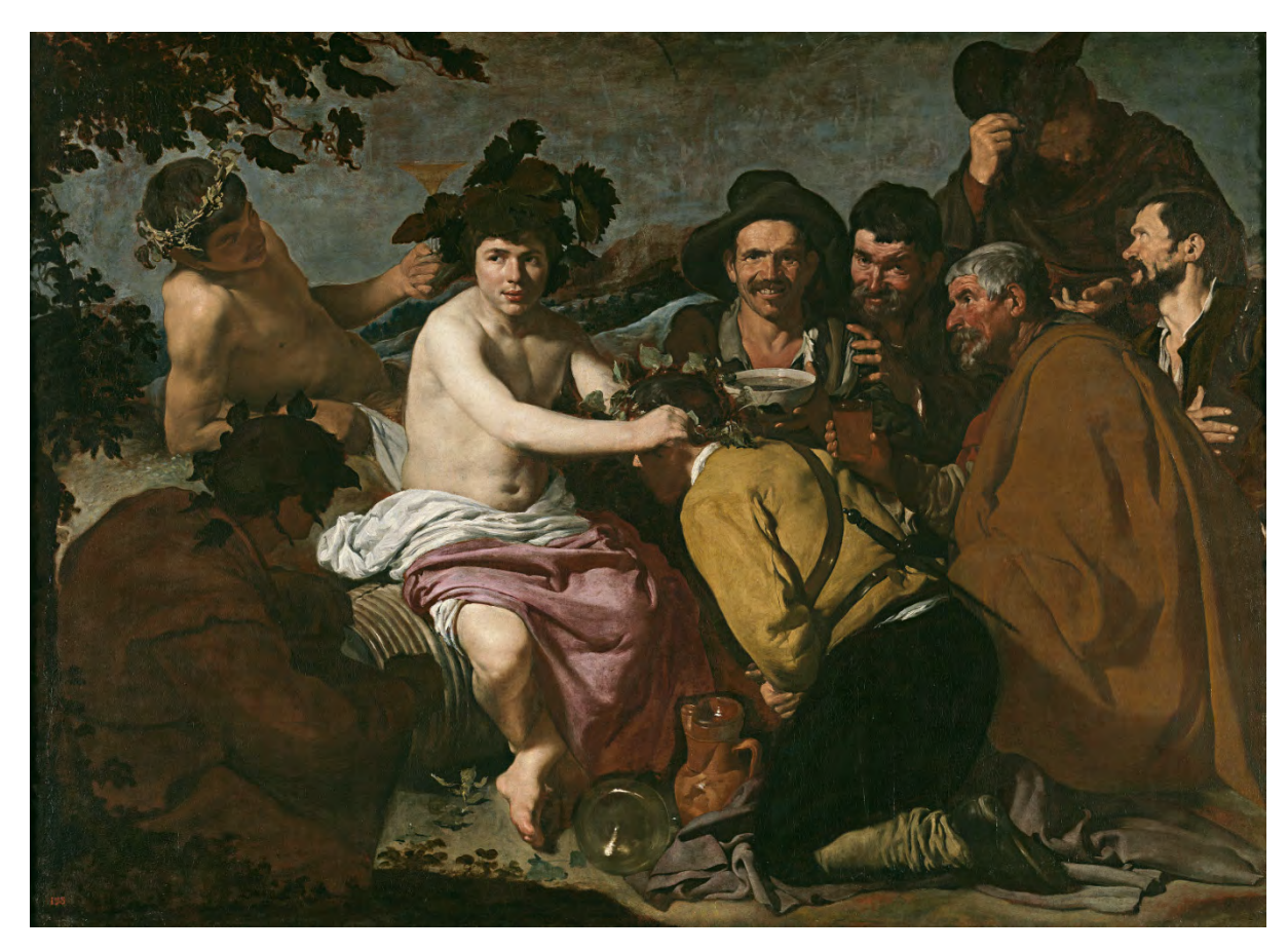
Figure 3: Diego Velázquez, El triunfo de Baco, o Los borrachos , 1628-9, Oil on canvas, 165 x 225 cm, Colección Real, Museo Nacional del Prado, Madrid.

Triumph of Bacchus], popularly known as Los borrachos [The Drunkards], by the Spanish master Diego Velázquez.