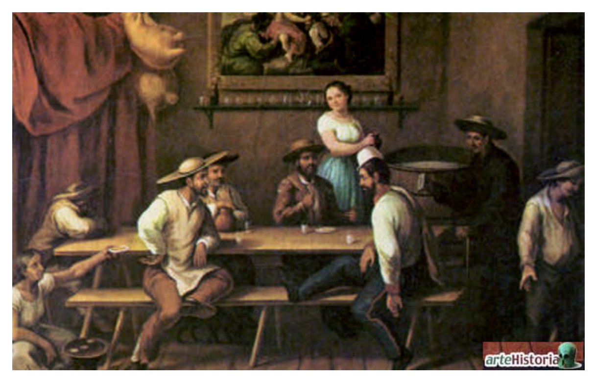
Figure 1: José Agustín Arrieta, Interior de una pulquería , 1850, oil on canvas, 96 x 73 cm, Museo Nacional de Historia de México, Mexico City.

first image is markedly more convivial than the second, which is slightly more dark and sinister.