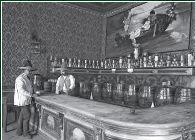
Pulque shop, ca. 1906.