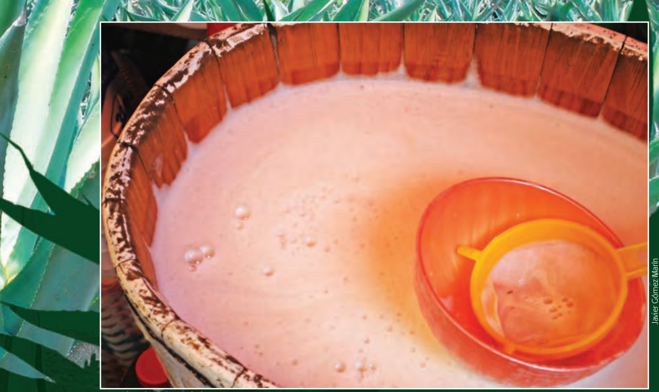
Vat with pulque from Chalma, 2011.